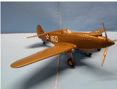
Tony D'Anjou built this 1/48 Airfix P-40 marked as one of the few American fighters that participated at Pearl Harbor.