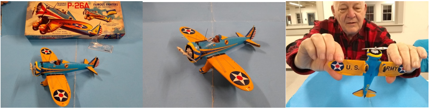
Bob Fiero built this vintage Aurora P-26A.