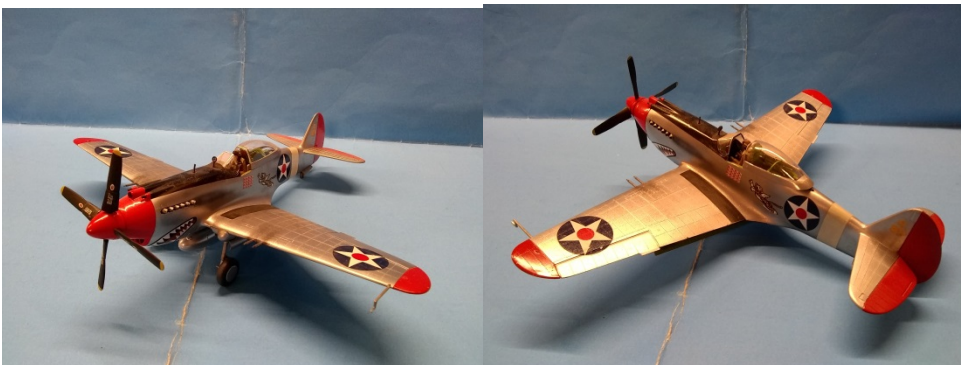
Tony D'Anjou had everyone scratching their heads with this one. . . A kit-bashed 1/48 Monogram P-40/P-51.